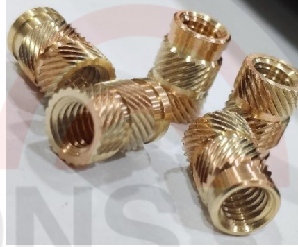
Type 2 - Without Flange