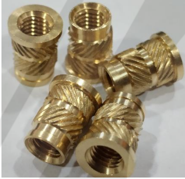
Type 1 - With Flange